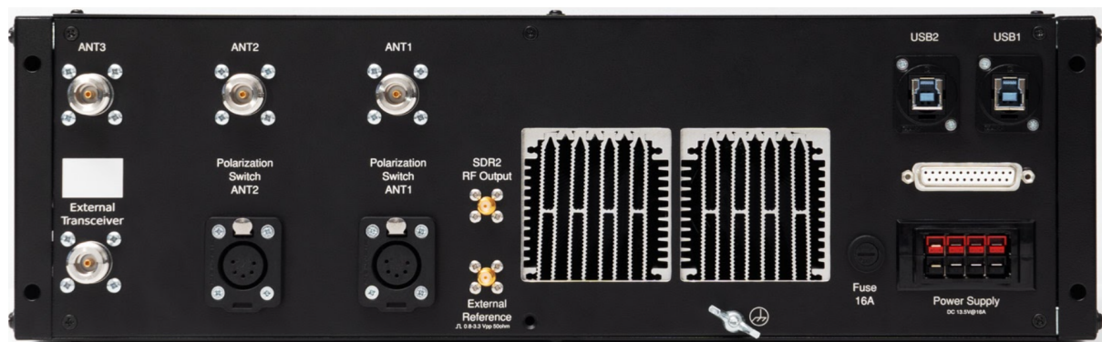
Figure 4 - SDR-Rack back panel