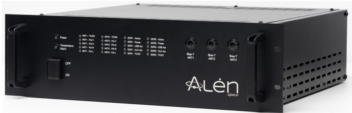
Figure 3 - SDR-Rack front panel

The SDR-rack front panel has the master power switch of the rack, some information LEDs and 3 Bias-T buttons with LED.